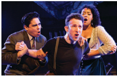
Keen Company's production of Tick, Tick... Boom!