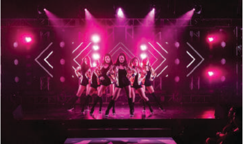
ARS NOVA, Ma-Yi Theatre Company, and Woodshed Collectives' production of KPOP

These two new performance venues in Hell's Kitchen have up to 87 and 149 seats respectively, and their fully-equipped technical and production resources are included in the weekly rentals. The multi-million dollar Rental Subsidy Fund provides subsidized rental rates for our members to address the urgent need for affordable performance space.