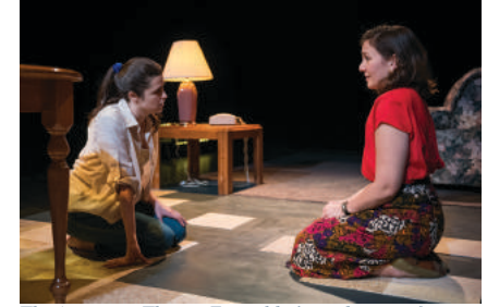
The Associates Theater Ensembles's production of Sheila