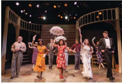
Boomerang Theatre Company's production of LOVELESS TEXAS

The NYSCA- A.R.T./New York Creative Opportunity Fund (A Statewide Theatre Regrant Program), supports organizational growth or the development of new work for theatres with budgets of $500,000 or under.