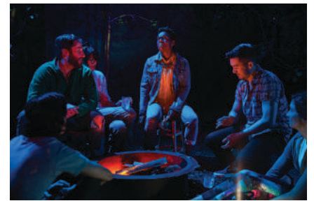
Live Source Theatre Groups's production of SOLSTICE PARTY!