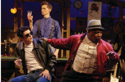
Pipeline Theatre Company's production of Folk Wandering

With support from the New York Community Trust , A.R.T./New York will launch Body Autonomy this summer to address issues and concerns around workplace harassment and abuse in the New York City theatre community. The program will work through the framework of restorative justice and body autonomy to create a cultural change through education and direct support to A.R.T./New York's member theatres.