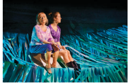
Concrete Temple Theatre's production of The Bellagio Fountain Has Been Known to Make Me Cry