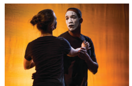
Broken Box Mime Theater's production of SEE REVERSE